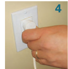
4 Plug in power cord — window will begin to move

When the window covering stops, press and hold the PROGRAMMING BUTTON of any transmitter until the window covering jogs twice. Do not release the PROGRAMMING BUTTON until the jogging is complete or you will have to start the dual power cut from the beginning. Please return back to PROGRAMMING MODE to initiate programming process.