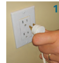
1 Remove plug from power for 2 Seconds

Perform a Dual Power Cut to delete all previous settings and return motor to FACTORY MODE.