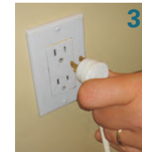
3 Remove plug from power for 2 Seconds