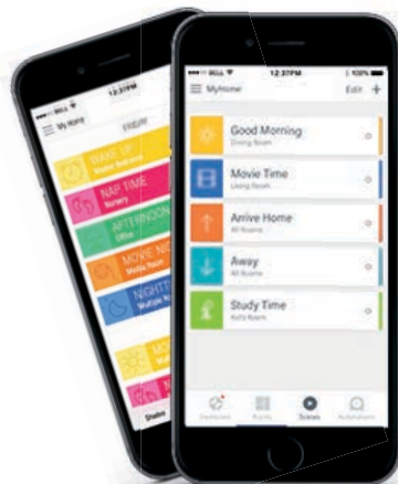
Phones with App Showing Rooms and Scenes