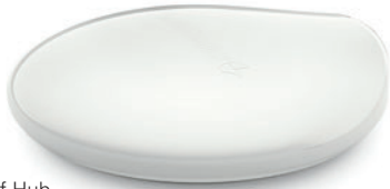
Front of Hub

Our latest enhancements allow for seamless integration throughout any space.