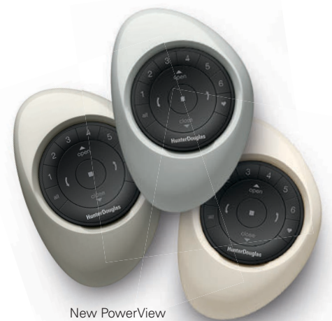
New PowerView Pebble Colors

Feature image: Silhouette® Window Shadings, Bon Soir™