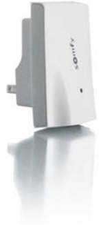
myLink™ is a registered trademark of Somfy.