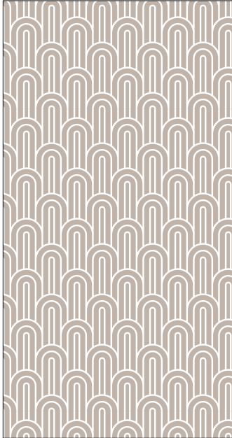
#1 Dapper Tan