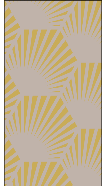
#2 Glitzy Gold

Samples can be requested via email at HDHsamples@hunterdouglas.com . Visit HDhospitality.com for Hunter Douglas Hospitality's complete product line.