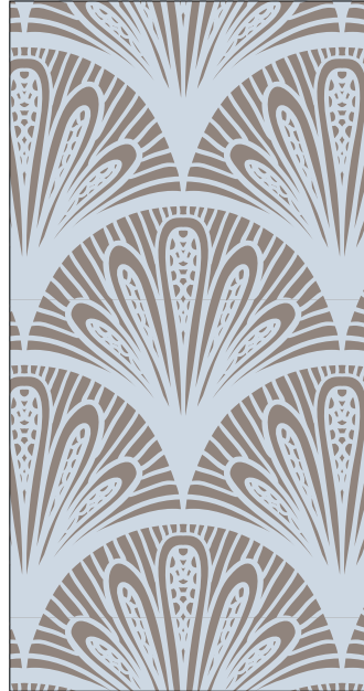
#1 French Blue