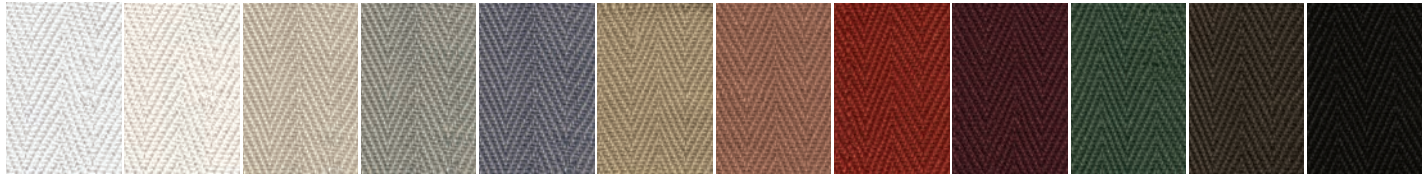
White Duck White Fawn Light Grey Dark Grey Beige Cappuccino Russet Mulberry Dark Green Chocolate Black