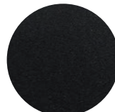
Flat Black Textured