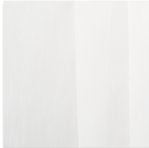
Winter White 3089411000